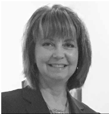
IMTA Website Chair

District audition registration deadlines and audition dates are on the website Events Calendar.