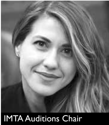
IMTA Auditions Chair

Mark your calendars for the IMTA State Competition at the University of Northern Iowa on March 9, 2024.