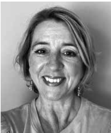
Iowa MTNA Membership Chair