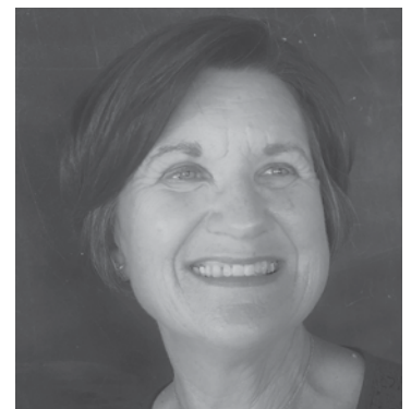
IMTA Certification Chair

Would a monthly group conversation on Zoom be what is needed to encourage busy IMTA teachers who would like to become Nationally Certified?