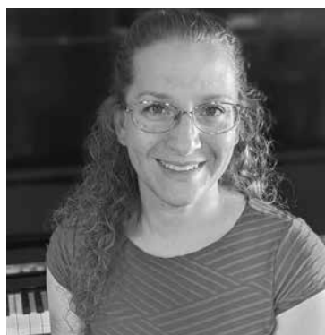
IMTA State Festival Chair