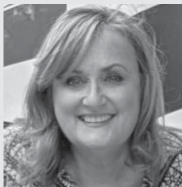
IMTA Information Editor

Our connections with one another span many generations. The conference team cannot wait to connect with professionals of all ages as our focus on duets and collegiate members offers something for everyone. If you know of a non-member who may be hesitant, or would like to attend the conference, please invite them. You may request an extra magazine from me and I will