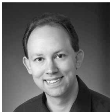
IMTA State Technology Chair

How does ChatGPT do this? While I'm no expert, the short answer is that it spends enormous amounts of time scouring the web and other sources for data and summarizes it for