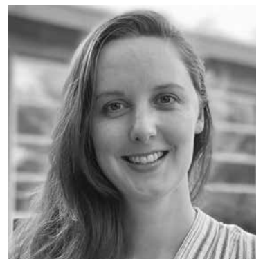
IMTA State Foundation Chair

Thank you all for being amazing teachers, and Happy Holidays!